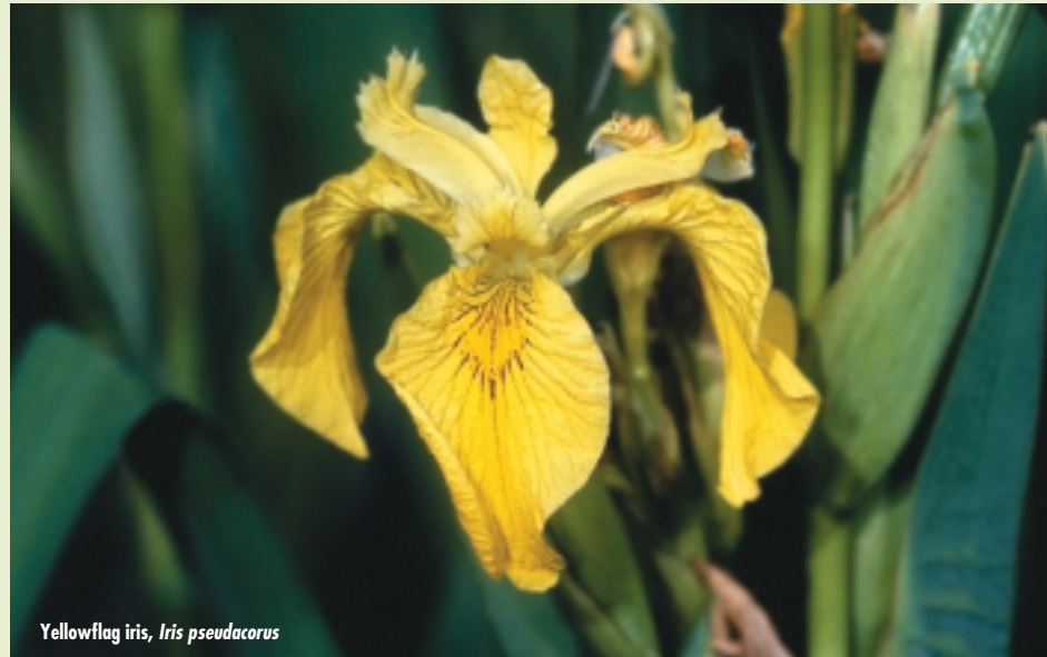
Yellowflag iris, Iris pseudacorus

list of pests currently regulated by Canada. The Agency conducts annual surveys across Canada to keep track of newly introduced pests and to check for selected invasive alien species that may arrive in Canada.