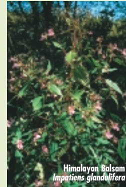
Himalayan Balsam Impatiens glandulifera