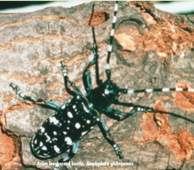
Asian longhorned beetle, Anoplophora glabripennis