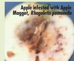
Apple infested with Apple Maggot, Rhagoletis pomonella