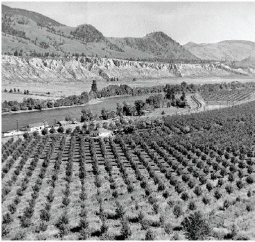
Orchards along the South Thompson River, 1947